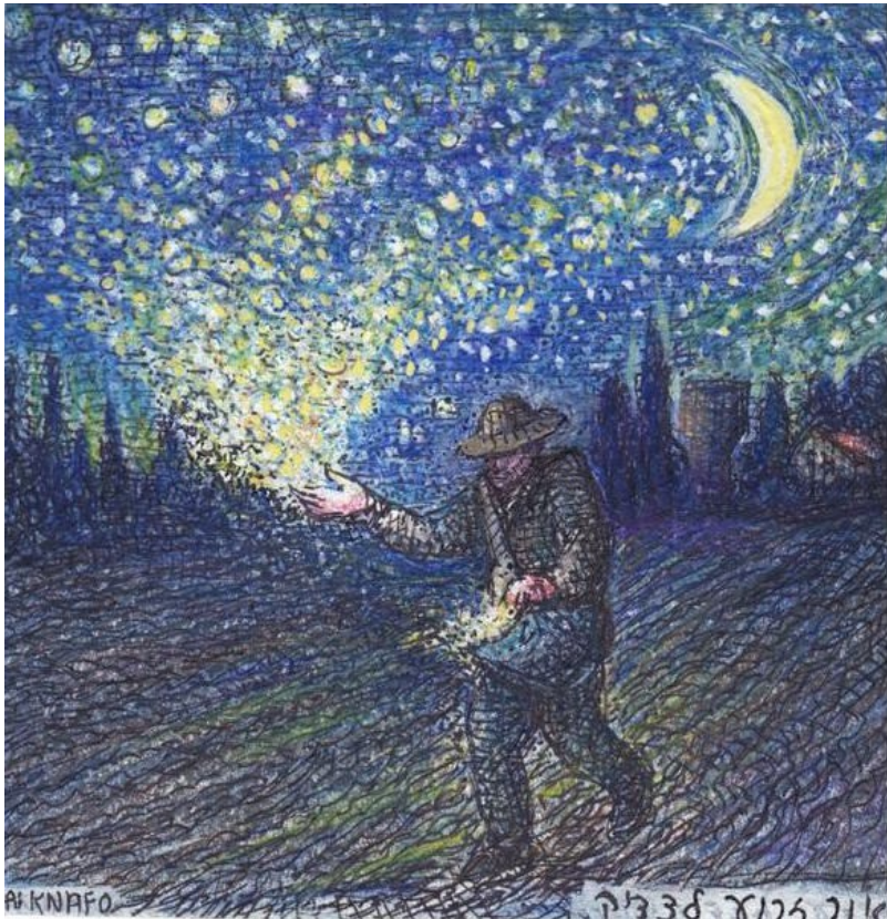
Starlight Sower by Hai Knafo

The musical setting for today's service is Dudman.